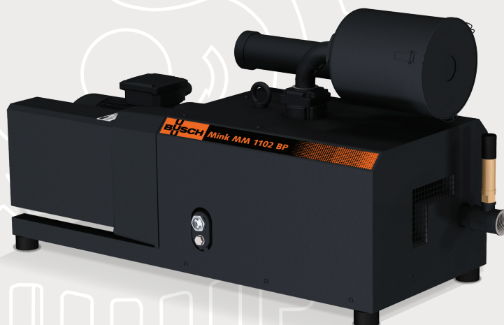
Mink MM 1102 BP

Mink – efficient and reliable compressed air generation.