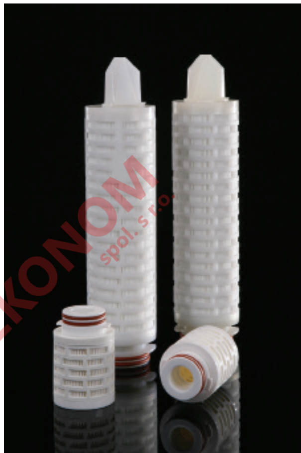
Note: TETPOR is a registered trademark of Parker Hannifin Corporation.