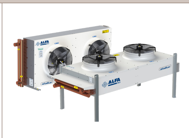
AlfaBlue Junior DG

All units are packed and shipped in horizontal airflow position. AlfaBlue Junior 501 & 502 units are mounted on a wooden pallet and covered with a sturdy cardboard box. All other models are mounted on a wooden pallet, wrapped with plastic foil and covered with an open crate.